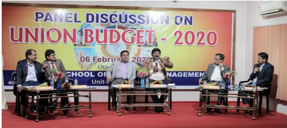
Panel Discussion: Explores new concepts through informative approach on contemporary topics