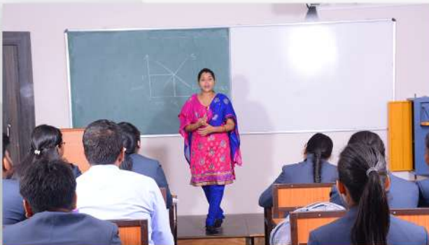
SMART LECTURE HALL