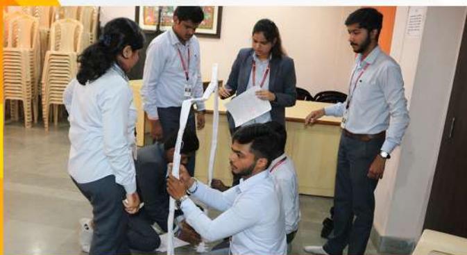
Business Game: Improves knowledge retention, decision making & team work