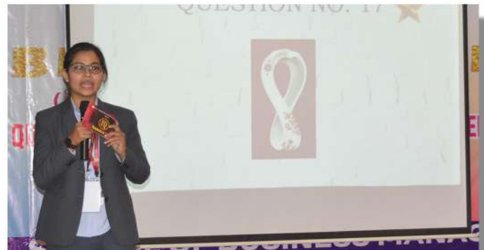
Subject Quiz: Strengthens the subject knowledge