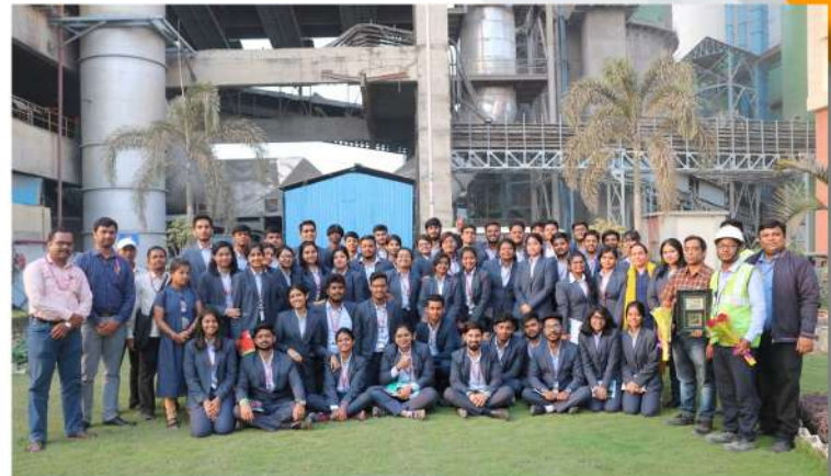
OCL, Tangi, Cuttack