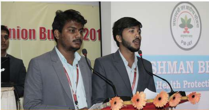
Symposium & Seminar: Develop insight into the specialised areas that facilitates expression of thoughts and interactions