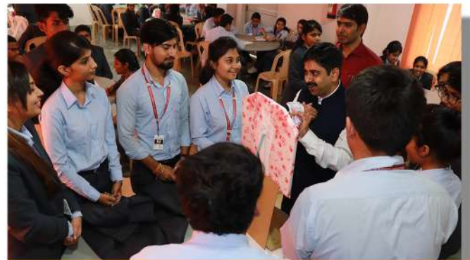
Workshop: Offers a platform to incorporate learning strategies in real life scenario