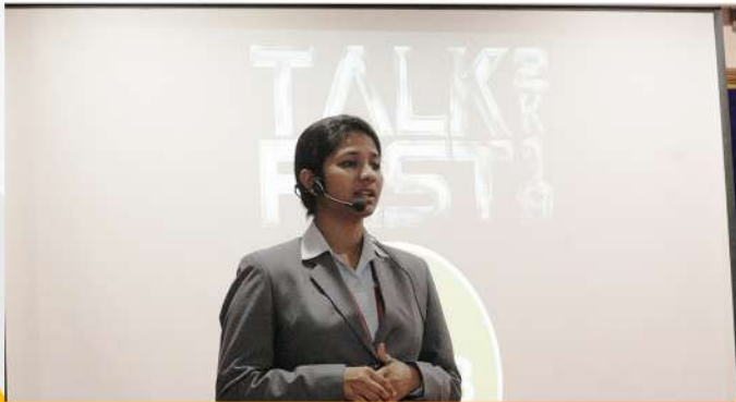
Talk Fest: Enhances oratorical skills