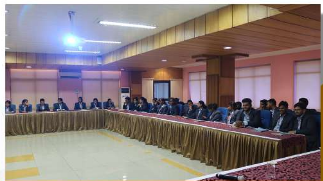
Industrial Visit: Acquaints with the corporate modus operandi